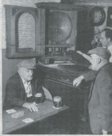
● MUSICAL BAR: Drinkers at the Boat Inn in Allerton Bywater in 1960

THIS week Times Past begins a series of articles looking at bygone boozers.